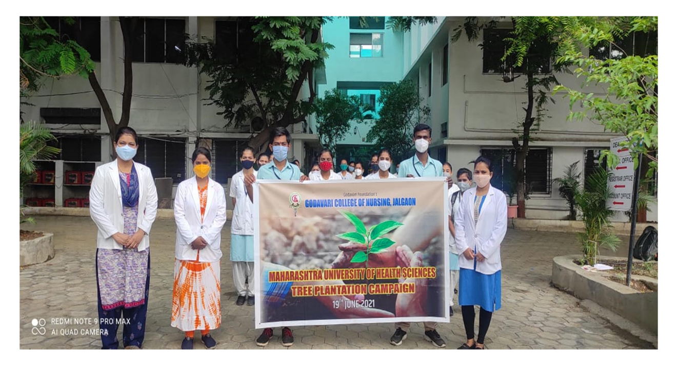
PHOTO – 19<sup>™</sup> JUNE 2021, MAHARASHTRA UNIVERSITY OF HEALTH SCIENCES, TREE PLANTATION CAMPAIGN – 2021.